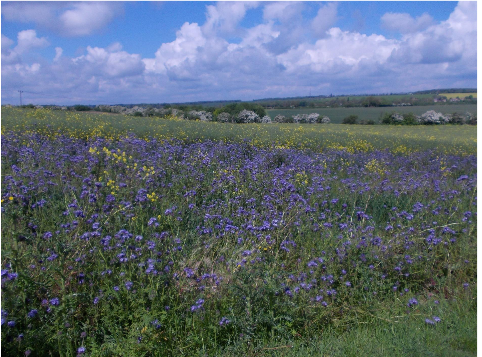
Coton Margin (edge of Cambridge)