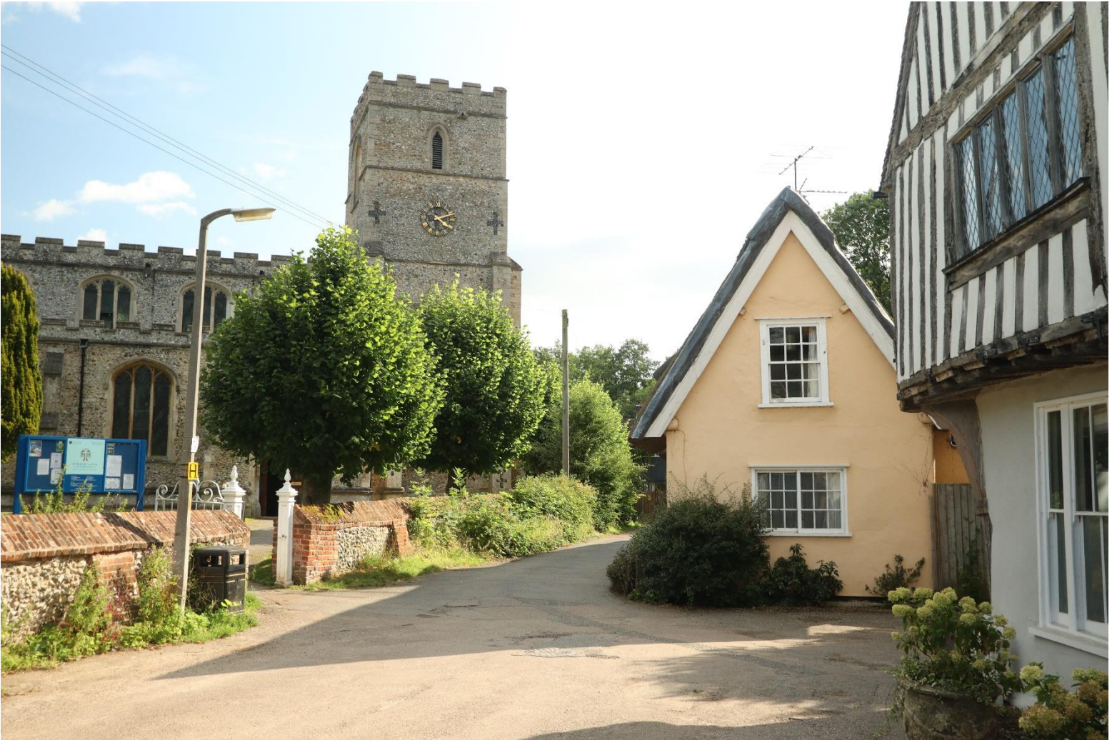
St Mary's Church, Linton Village